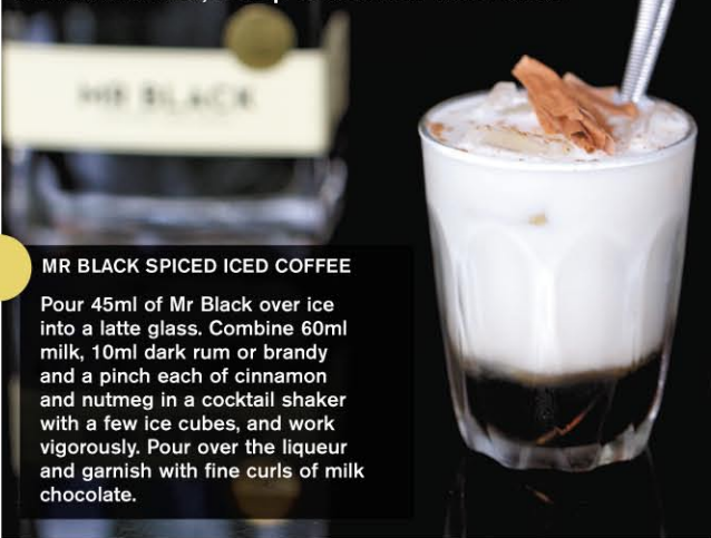
MR BLACK SPICED ICED COFFEE